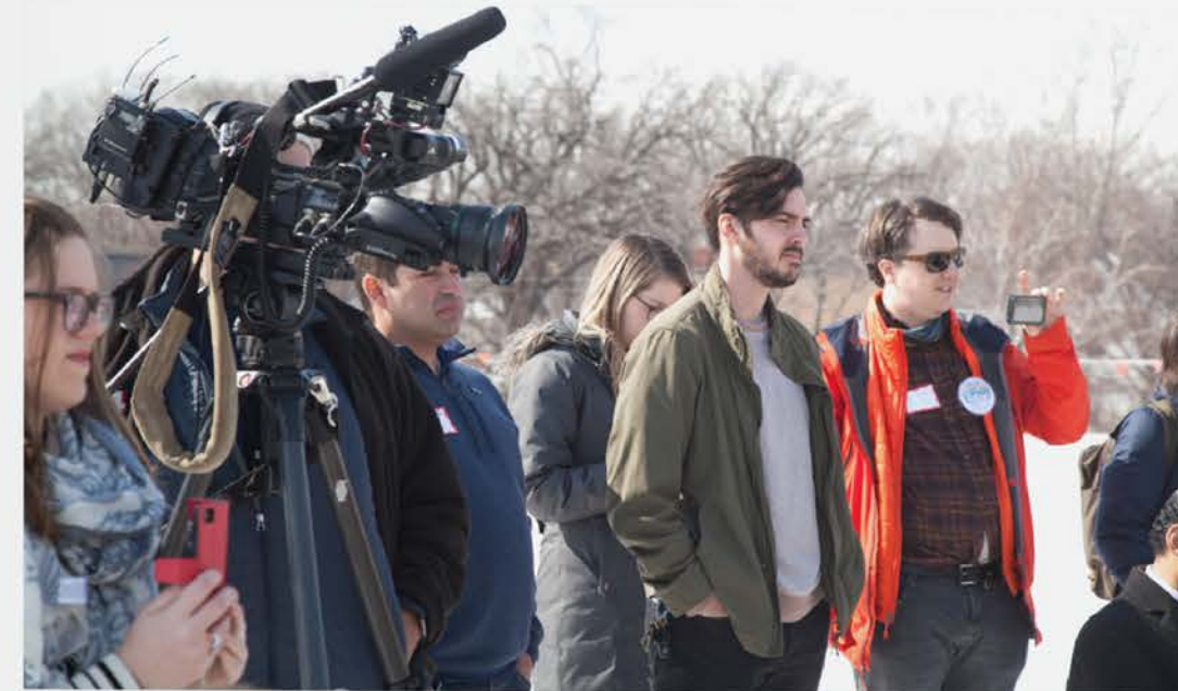
Community members and media gather for the ribbon cutting of a community solar garden on the roof of Shiloh Temple in North Minneapolis.

Visit pressforward.news/guide to check out the toolkit.