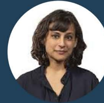
Angelica Das Democracy Fund