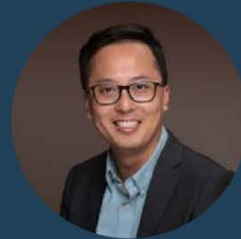
Duc Luu Knight Foundation