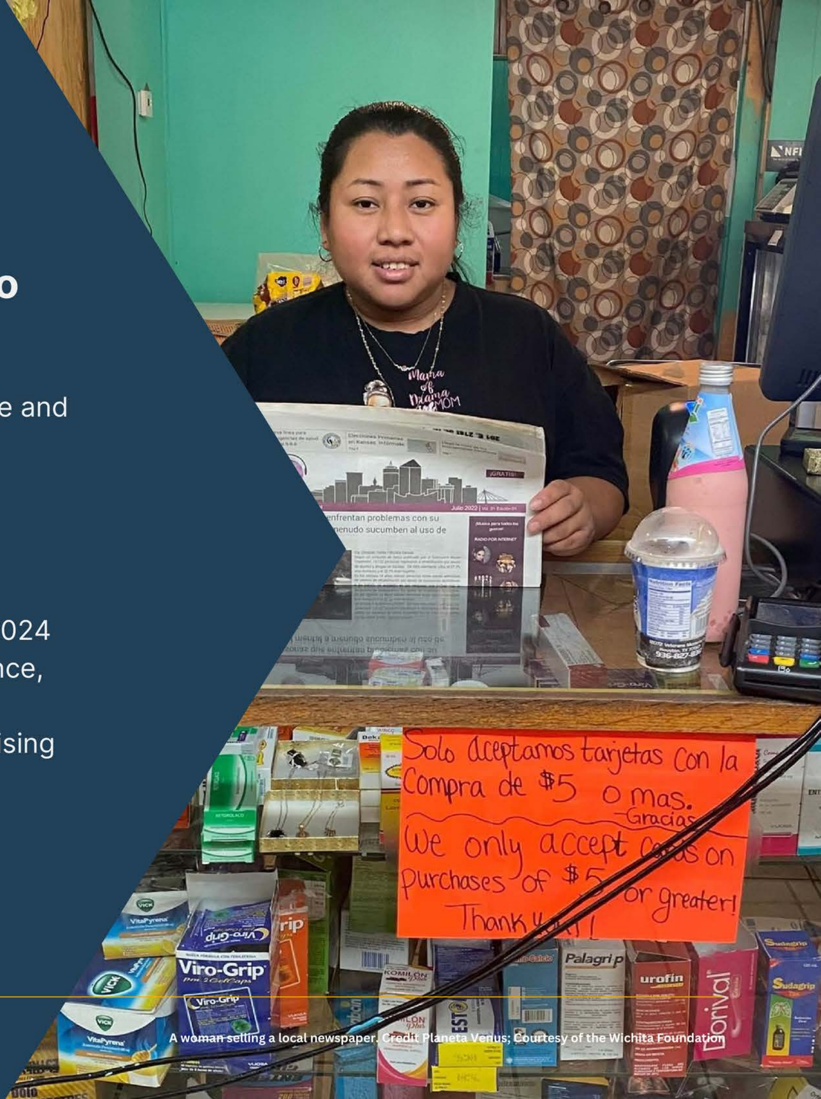
A woman selling a local newspaper.