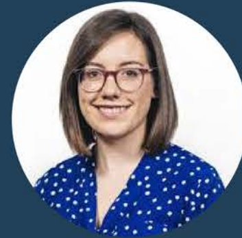
Teresa Gorman Democracy Fund